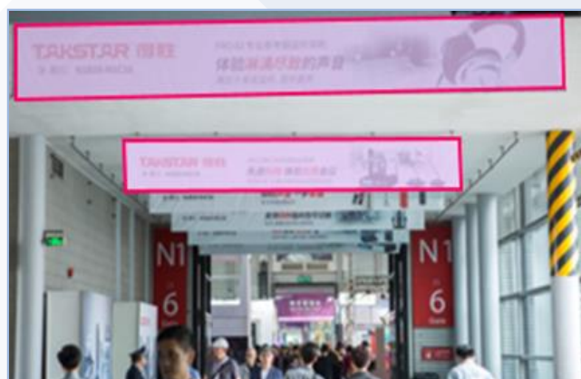
C02 Hanging banner – Corridor

Specification: 5m (H) x 8m (W) Price: USD 4,000 / pcs