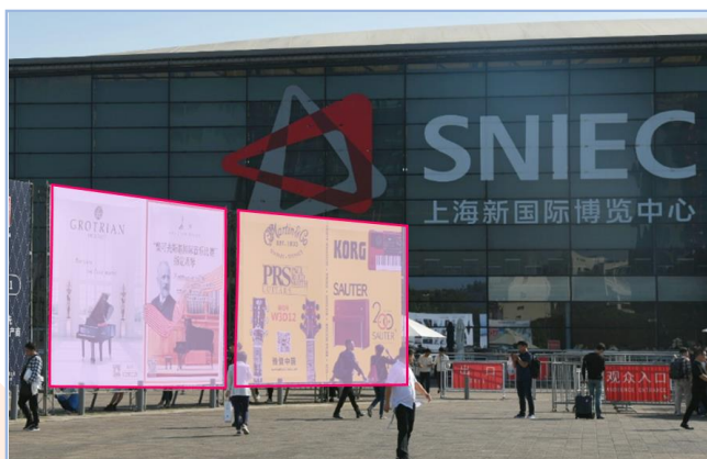
C01 Outdoor billboard – 1# South Square

Specification: 5m (H) x 8m (W) Price: USD 4,000 / pcs