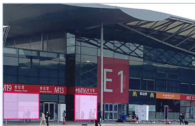
C04 Glass sticker – Hall external

Specification: 2.5m (H) x 3m (W) Price: USD 2,000 / pcs