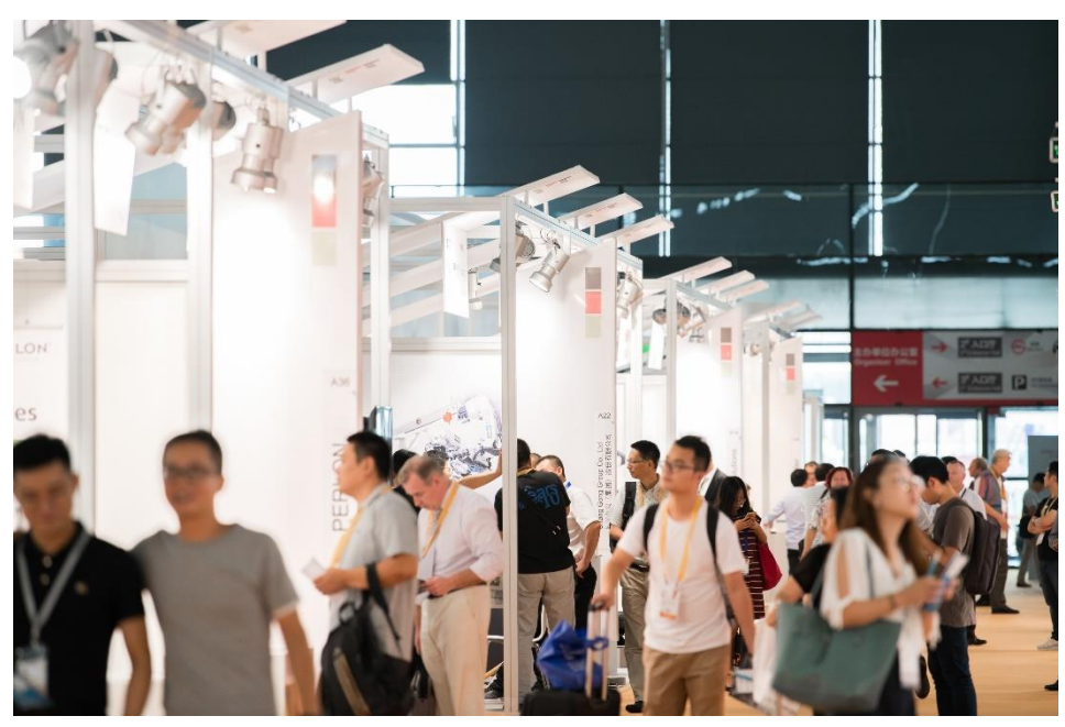
The German Pavilion at Cinte Techtextil China 2018

In addition to products for the Protech and Medtech sectors, exhibitors in the pavilion will also showcase their latest solutions for the Indutech, Mobiltech and Oekotech application areas.